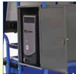
Lock Box for CPU