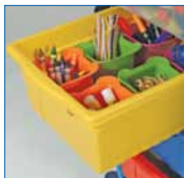
Sliding tubs for quick access to supplies