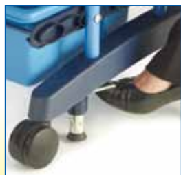
3" (7cm) casters with Foot-Activated Brake