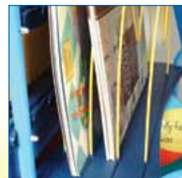
Storage for Big Books