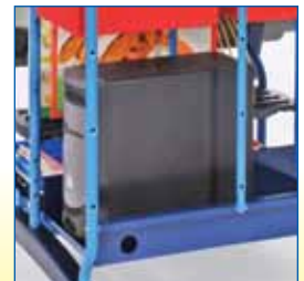
Shelf for CPU