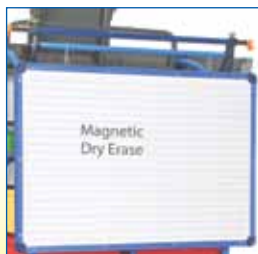
Removable lined magnetic dry erase board (AC455)