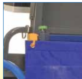
Telescoping accessory hooks for pocket charts