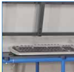
... keyboard or monitor