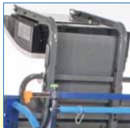
Ultra-Short Throw Projector Arm [patent pending]