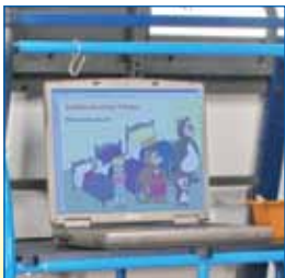
Top shelf for laptop ...